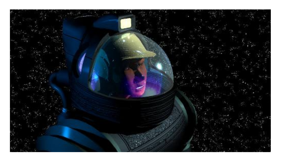
The model had been created with Amapi and ray-trace rendered with StrataVision 3D 5.0

These few lines are not a well structured tutorial. So, if you are an Amapi beginner, it may avoid wasted time.